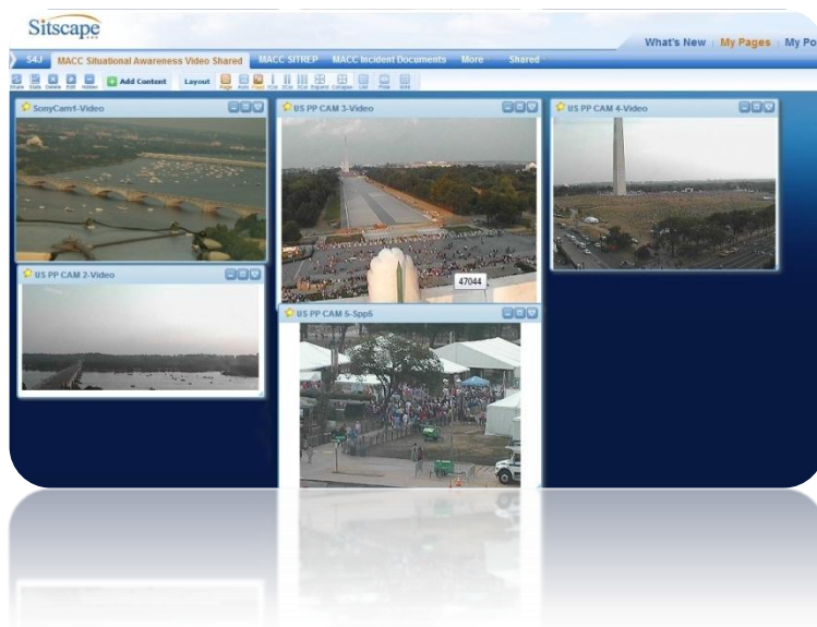
Figure 1 - SitScape 4th of July Emergency Management COP This Common Operating Picture (COP) display helped federal and local emergency management officials monitor activity throughout the National Mall on 4 July, 2012

Beginning in the spring of 2012, SitScape began to work with personnel from a number of federal and local law enforcement agencies involved with Washington, DC July 4 th celebration emergency management effort. The United States Park Police (USPP) served as the coordinating agency for the project, and SitScape served as the collaborative and common operating picture (COP) software for participating agencies. In the Multi-Agency Coordination Center (MACC), SitScape played a key role in facilitating information flow between federal and local agencies and their command and operational units.